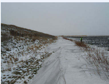
Shrub willow living snow fences catch snow blowing across agricultural fields and keep it off highways.