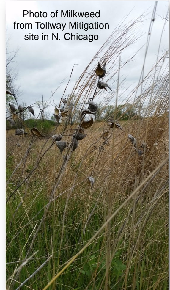
Photo of Milkweed from Tollway Mitigation site in N. Chicago