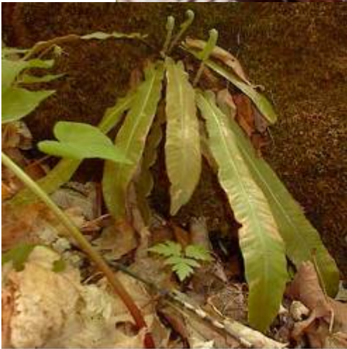
American hearts-tongue fern