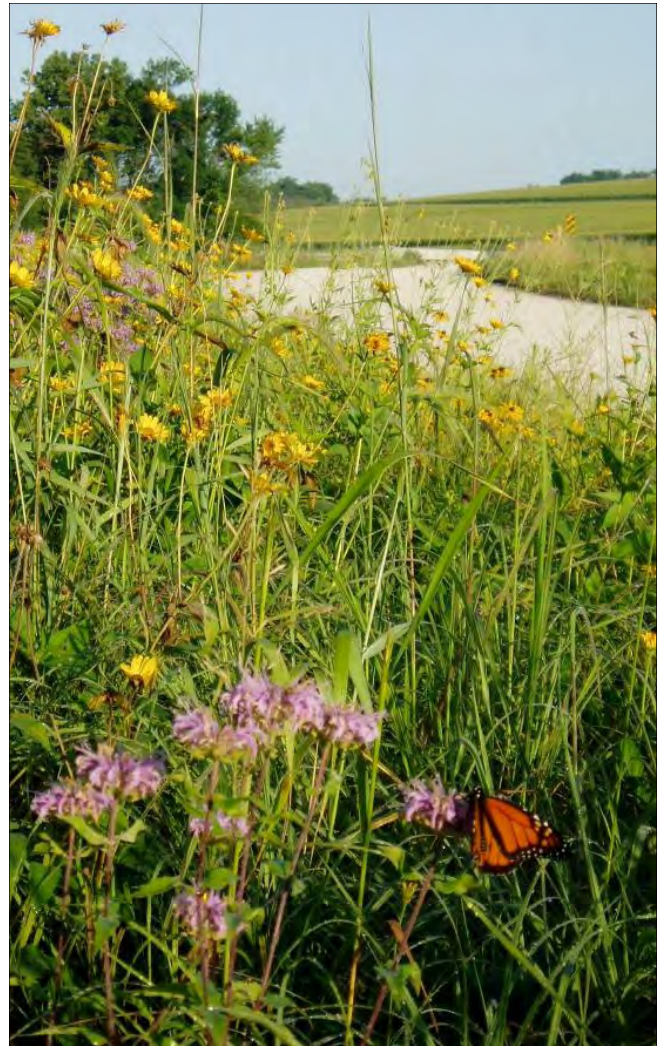
Stretching across landscapes that are generally inhospitable to wildlife, roadsides link other habitats and provide food for pollinators, including migrating monarchs.

Given their linear structure, roadsides may serve as corridors for pollinators and other wildlife. In Iowa, Ries et al. (2001) found that habitat-sensitive butterflies were much less likely to leave a roadside planted with native vegetation, suggesting that for some butterflies, roadside restorations could serve as protective corridors through which pollinators could move in highly modified landscapes. For example, roadsides could become corridors for breeding monarch butterflies returning north from their overwintering grounds, because their caterpillars feed exclusively on milkweeds ( Asclepias ), which grow readily in roadsides and are sometimes included in reseeding mixes. These same roadsides can also be nectar corridors for monarchs making the long trip south in the fall.