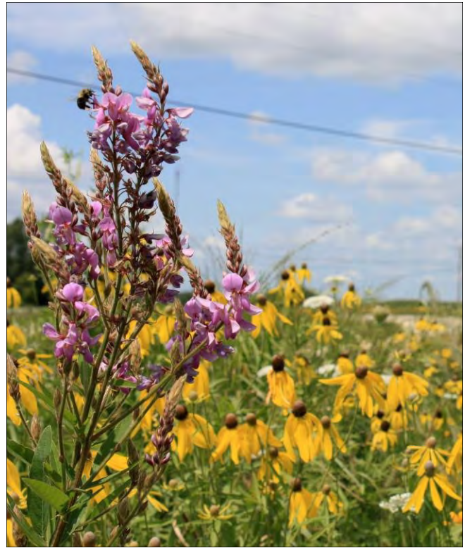
Native plants offer several advantages for roadside management, such as erosion control and reducing the need to use herbicides, as well as improved habitat.