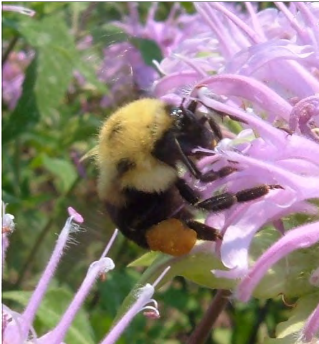
Bees and other pollinators are an essential component of any terrestrial ecosystem. Their basic habitat needs—flowers for nectar and pollen and a place to nest—can be successfully provided for on roadsides.

In North America, most pollinators are insects: bees, flies, beetles, wasps, moths, and butterflies. Hummingbirds also pollinate some flowers, as do a couple of species of bats and a dove in the desert southwest. Pollinating insects have two basic habitat requirements: a source of food and a place to lay their eggs. Understanding which features in the land-