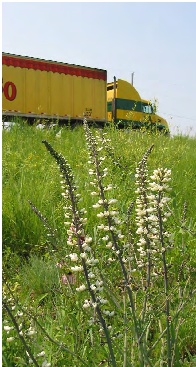
Despite the proximity of apparent danger, roadsides rich in native plants provide valuable habitat to pollinators and other wildlife.

http://www.dnr.state.mn.us/roadsidesforwildlife/index.html