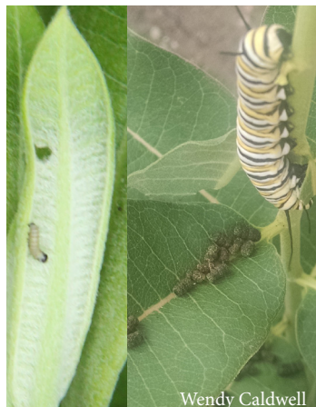
Right: Look for signs of monarch presence such as small chewed holes from first instar caterpillars and frass from fifth instars.