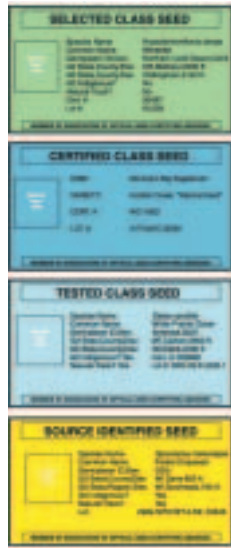
Figure 1. Pre-variety germplasm and variety/cultivar seed tags (Young and others 2004).

12. How can I be sure I'm buying seeds with the genetics I want ?