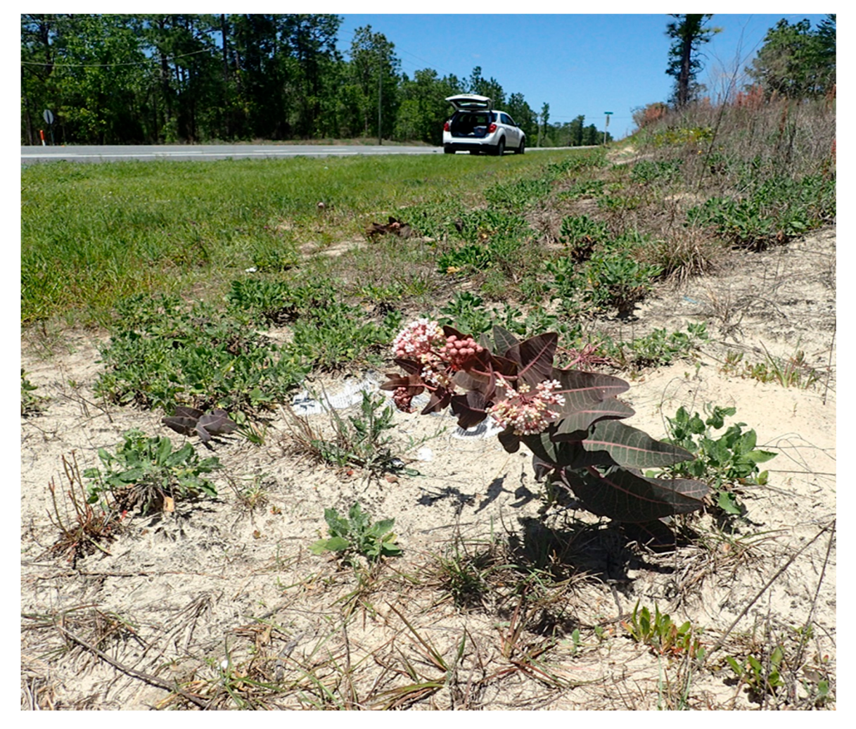
Figure 3. Road verge showing a population of pinewoods milkweed ( Asclepias humistrata ) with plants growing on the back upward sloped portion where exposed sand occurs.

Based on the survey data, plant densities ranged from 1 to (an estimated) 500 individuals per site. As a result, plant locations were subsequently categorized as either high or low density. This was done for the purposes of identifying proposed priority locations for evaluating current and future vegetation management (e.g., mowing, selective herbicide application). Sites were considered high density if they contained at least 1 plant for every 2 m of road verge and were at least 10 m in overall length (parallel to the road) from the first plant to the last plant. Alternatively, sites were considered low density if they failed to meet one or both of these requirements. Based on these criteria, a total of 35 A. humistrata and 0 A. tuberosa locations were characterized as high density, proposed priority locations (Figure 1). As A. tuberosa is more likely to occur singly and is much more difficult to immediately identify in the landscape from a distance unless in flower, the lower numbers recorded may be an artifact related to detectability.